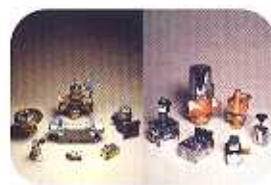
Special and Standard Valves

Off-the-shelf manual vises and tombstones with machinable reversible jaws. A combination of hardened steel alloy ways and a lightweight aluminum base makes the Rhinovise both easy to handle and durable.